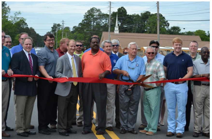
Officials Celebrate Completion of Adams Street Renovations