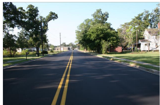
Resurfaced Brumby Street in Reidsville, GA

Collections of this one cent sales tax began in January 2013 to fund projects in Band 1 (Jan. 2013 – Dec. 2015), which are scheduled to at least begin construction by the end of 2015. To date, more than $328 million has been collected of the budgeted $1.2 billion. This total includes $68,737,178 collected of $255,524,067 budgeted for 764 projects in the Heart of Georgia Altamaha region.